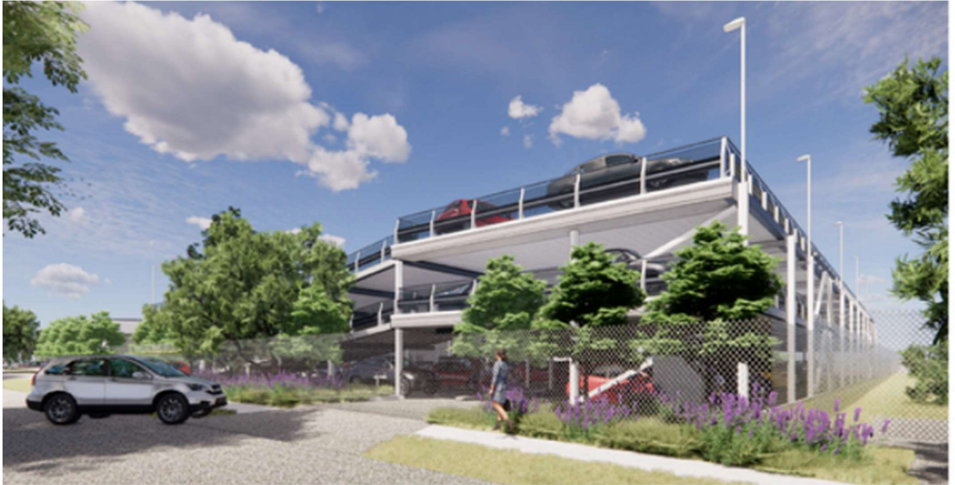
Image 2. Render of Development St from Forward St

This announcement has been approved for release by the Board of Directors.